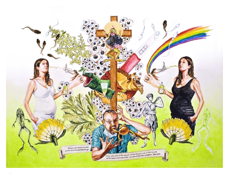
Rose Briccetti, Artemesia absinthum (wormwood), 2017, watercolor on panel, 36 x 48"

The works in this show, a strikingly diverse collection of approaches and interests realized in an equally broad range of methods and media, form the selected output of the six UCSB graduate students about to conclude their Master of Fine Arts studies. It is at once the carefully edited product of the research they are concluding, a current snapshot of where they now stand, and just possibly a glimpse of their future.