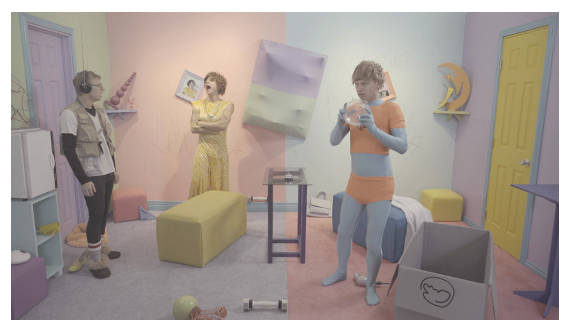
Scotty Wagner, Trial Child: Nurture a Better Nature , 2017, video and installation 8 x 12 x 8'

Opening Reception May 19, 2017 5:30 - 7:30pm