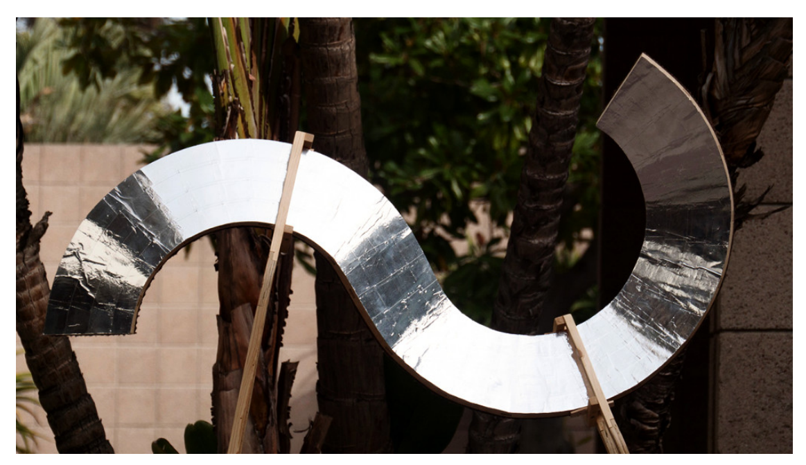
Peter Sowinski, Table For Marini , 2016, wood, outdoor carpet, foil tape, 36" W x 10" D x 55" H