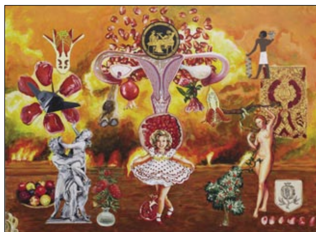
Grenadine (Punica Granatum and Geopolitics) by Rose Briccetti